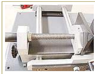
EV 90DM Bandsaw Vise Screw