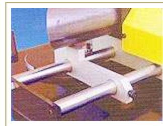
EV 90DM Bandsaw Vise