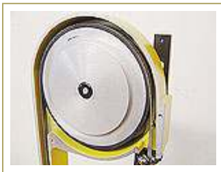
EV 90DM Bandsaw Pulley Wheel