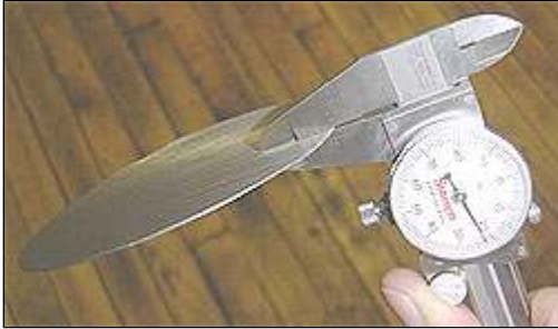
4" aluminum bar stock cut 22 thousandths of an inch