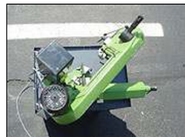
finish at 60°

On all KAMA Band Saws the head swivels, not the vise. Stock tables stay in one place saving valuable shop floor space.