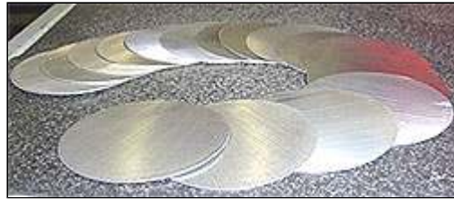
more of the same