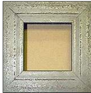
perfect miters assemble without retouching

We have designed and created this powerful KAMA bandsaw with exceptional and innovative technical specifications that are unique to the market. Ongoing research, application and development are the results of many years' experience in the field that is confirmed by thousands of satisfied customers.