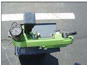
Starting at 90°

Our experience guarantees a range of KAMA band saws capable of satisfying all cutting requirements in a fast, precise and completely safe manner.