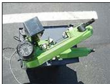
The head swings through to