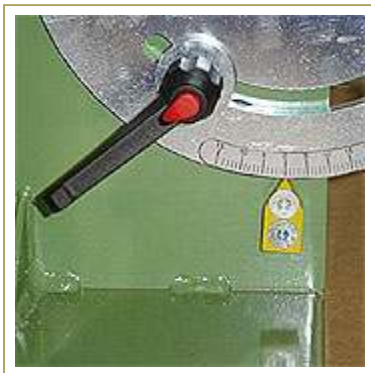
Precision mitering table

The work table miters from horizontal to 45° and the gap between the plate throat and sanding belt is adjustable.