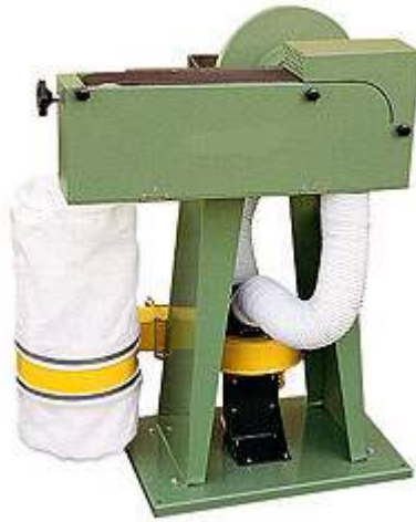
KAMA ASP-6 Integrated Dust Extractor

Elderfield & Hall, Inc., 222 N Maplewood Ave., Chicago. IL 60612. Toll-free: 1.800.747.9353. Fax: 312.829.6733. Website: http://www.kooltools.com . E-mail: bob@kooltools.com .