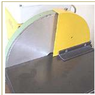
One Guard Notice the Dust Seal on right