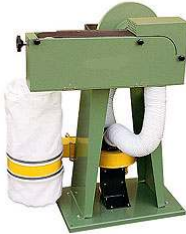
KAMA ASP-6 Integrated Dust Extractor

Elderfield & Hall, Inc., 222 N Maplewood Ave., Chicago. IL 60612. Toll-free: 1.800.747.9353. Fax: 312.829.6733. Website: http://www.kooltools.com . E-mail: bob@kooltools.com .